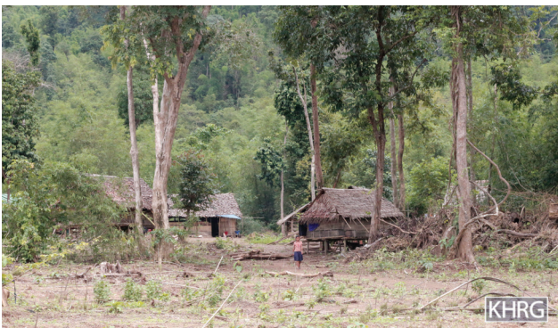
This photo was taken in Ma Yah Hpin village, Moo (Mone) Township, Kler Lwee Htoo (Nyaunglebin) District on June 24 th 2017. The photo shows houses in Ma Yah Hpin village, where IDPs have returned.

Lack of confidence in the peace process, distrust in government administration, and feelings of being discounted by the current government were also expressed by returnees and serve as clear indicators that the historical realities of conflict and violence are not yet (but in need of) being addressed as part of repatriation and reintegration initiatives. By calling attention to these problems, the current report highlights the challenges faced by returnees so that actions can be taken to better promote their sustainable and dignified return. Throughout this report, KHRG privileges the lived experiences of return to amplify the concerns of returnees, whose voices should be taken into account by the Myanmar government and relevant ethnic armed organisations and aid providers.