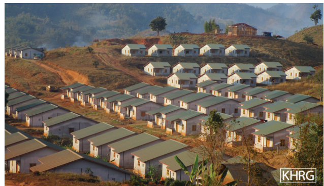
This photo is from a video taken of Kaw Lah village, Kaw T’Ree (Kawkareik) Township, Dooplaya District on February 6 th 2020. Kaw Lah village is one of several designated repatriation/resettlement sites for returnees. Pictured is the Three Hundred Houses area where new housing was built for refugee and IDP returnees.