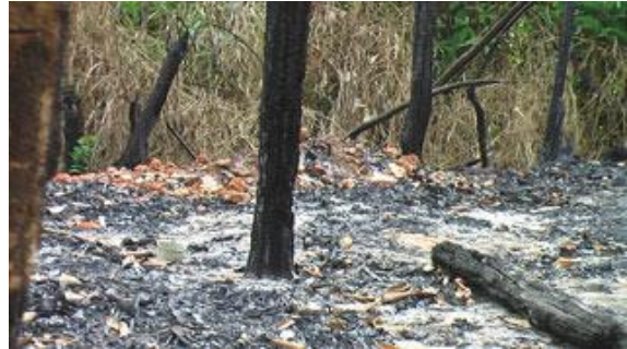
These photos, taken on April 16 th 2010, show T'Kaw Saw village in Than Daung Township, after being attacked by SPDC soldiers from the Southern Regional Command Headquarters in November 2009. According to KHRG's field researchers, between 20 and 30 households comprised of more than 200 people fled the attack. During the attack two villagers were shot on sight and the village was burnt. The villagers have remained in hiding, unwilling to return to T'Kaw Saw due to ongoing SPDC operations in the area.