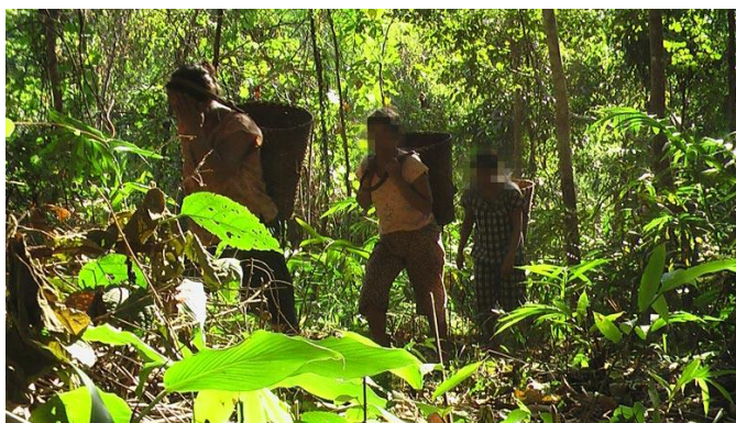
This photo, taken on January 12 th 2010, shows villagers ordered from several villages by SPDC LIB #427 to porter rations from their base at Gkaw Thay Der, Tantabin Township to the army camp at Th' Ay Hta.

SPDC units active in Toungoo District typically start to send rations to re-supply their bases along the main roads in October and November, when the rainy season ends; this can continue until December or January, depending on the state of the roads. 6 Supplies are transported by truck from the SPDC Southern Regional Command 7 headquarters in Toungoo town to the larger bases along the Toungoo to Kler La to Mawchi road, and the Kler La to Buh Hsa Kee road, including Bpeh Leh Wah, Kler La, Gklay Soh Kee, Th'ay Hta, Gkaw Thay Der, Naw Soh, and Buh Hsa Kee. This delivery is carried out using a limited number of army trucks and by commandeering civilians' trucks and motorcycles. 8 The second stage of the re-supply operation entails transporting rations from depots at the bases along the main roads to more remote camps nearer the front lines. This takes place between January and March and is largely completed through the use of forced porters demanded from villages located near army camps or, as previously documented by KHRG, the use of convict porters imported from prisons around Burma. 9