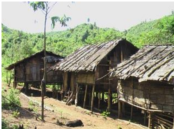
This photo, taken on October 20 th 2009, shows villagers' field huts in a hiding site near Th'ay Kee, Tantabin Township. Th'ay Kee was abandoned in 2006 due to SPDC operations, but many villagers remain in hiding sites nearby and attempt to cultivate their fields.