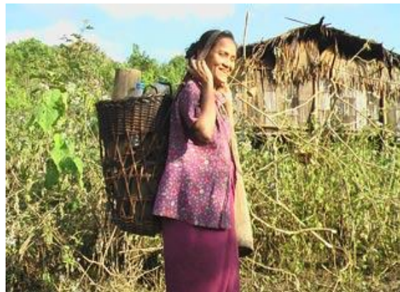
This photo, taken on December 18 th 2009, shows a villager in the May Bplaw Per hiding site in Tantabin Township. Villagers originally from Th'ay Hta as well as Gklay Hta stay in May Bplaw Per in order to continue living beyond SPDC control, despite threats to their physical security