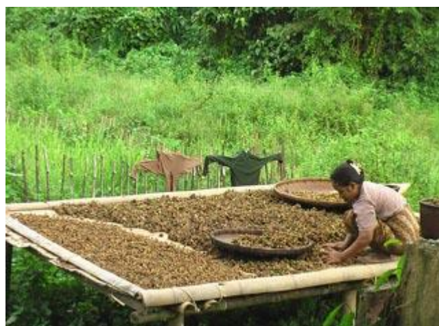
This photo, taken on November 19 th 2009, shows a displaced villager originally from Sho Koh village, Than Daung Township, drying cardamom pods after they have been harvested. Many Toungoo villagers raise cardamom because it is durable and can be easily carried long distances to trade for food and other essential items

From January until the end of May, for example, is the period for harvesting and selling betel leaf. The price of betel leaf changes each month depending on supply; in March the price rises from 3,000 kyat (US $3.06) to as much as 5,000 kyat (US $5.10) per viss (1.6 kg. / 3.6 lb.). For those villagers keeping durian plantations, the durian trees flower in March and the fruit can be