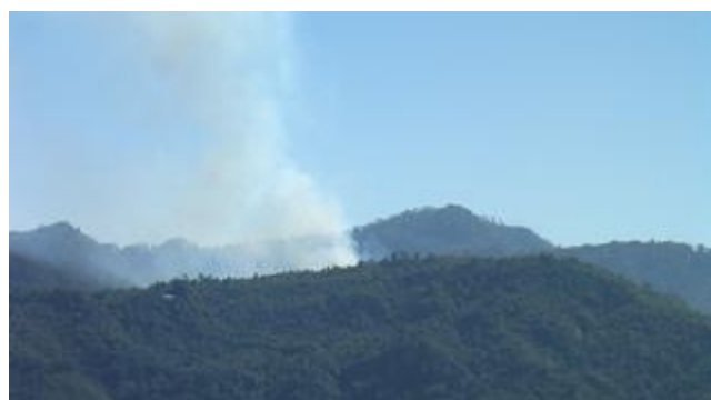
This photo taken on February 8 th 2010, shows smoke rising from the burning cardamom plantations along the Kler La to Buh Hsa Kee road between See Kheh Der and Plaw Moo Der. Patrolling SPDC forces set fire to vegetation along the road, including cardamom plantations, while rations were being delivered to camps in the area.

between income earned from cardamom and support for the KNLA. In 2006 an SPDC radio message supposedly instructed units deployed to Toungoo District to step up the destruction of cardamom crops as well as other fruit plantations that might serve as a source of finances for the KNLA, and thereby force the group to negotiate with the SPDC; a similar order was