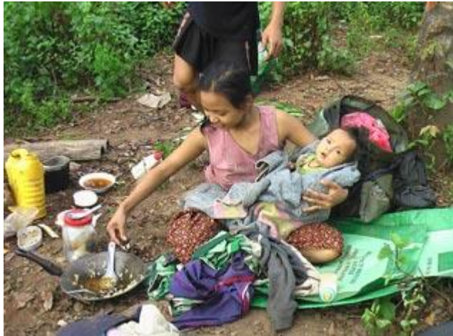
This photo, taken on November 19 th 2009, shows villagers from Th' Ay Kee, Tantabin Township after they fled into the jungle to avoid SPDC patrols during re-supply operations after the 2009 rainy season.

KHRG continues to receive reports of attacks by the SPDC on villagers detected in areas outside of regular military control. As noted above, villagers inhabiting areas with a strong SPDC presence often find themselves compelled to disobey tight restrictions on their movement imposed by local authorities in order to carry out basic and necessary livelihoods activities.