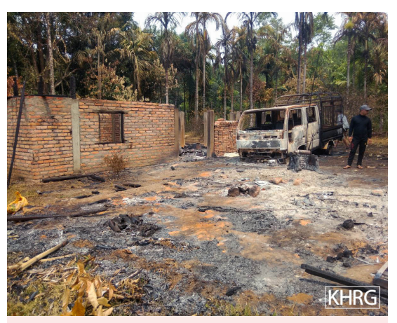
This photo was taken on April 8th 2022 in Meh Keh village, Meh Keh village tract, Th'Yeh Chaung Township, Mergui-Tavoy District. It shows the villagers' house, truck and property inside were burned down by the SAC.