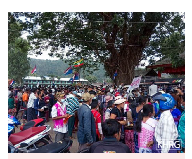
This photo was taken in February 2021 in Bl--- Town, T'Naw Th'Ree Township, Mergui-Tavoy District. It shows local civilians holding anti-coup protests. SAC soldiers were reported to have arrested participants in the days following the protests.

Villagers repeatedly described that SAC soldiers consider civilians in Southeast Burma as "enemies", warranting any violent act against them. According to villagers' testimonies gathered for this report, abuses against civilians are fuelled by the Burma military's beliefs that civilians living in locally-defined Karen State are averse to the junta's rule: sometimes perceived as active participants in the anti-coup protests and Civil Disobedience Movement (CDM), other times targeted due to ethnic kinship.