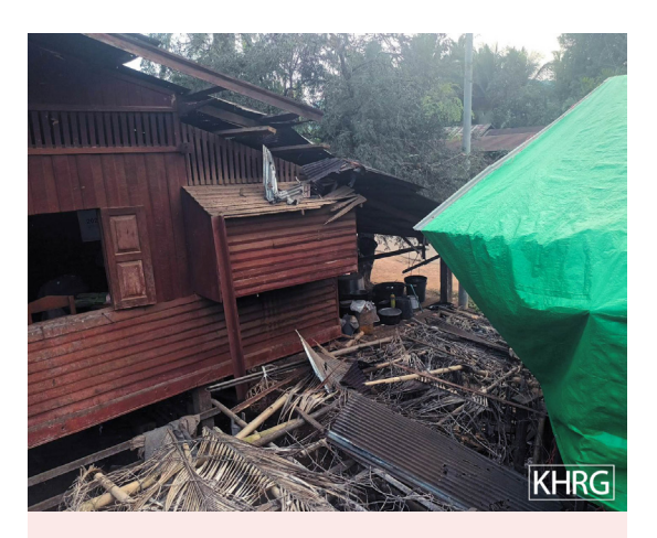
This photo was taken on March 24th 2022 in Htee Moo Hta village, Noh Hpoh village tract, Kaw T'Ree Township, Dooplaya District. It shows a house that was damaged by indiscriminate shelling undertaken the same day by SAC LIB #355 during an armed clash. A 17-year-old girl was killed and three other villagers were wounded in the attack.

These suspected links between villagers and resistance forces are sometimes not unfounded. As explained by Ma S---, a female interviewee from U--- village, Bo--village tract, Tha Htoo Township, Doo Tha Htoo District, SAC attacks launched in November 2021 against civilians in Kyeh Htoh Township occurred because PDF supporters and messengers were living in the village: "The SAC burned houses because many PDF supporters messengers live in the village. They [SAC] even said: 'there are villagers who joined the PDF from this village'." As the witness reported to KHRG, "the SAC soldiers [also] slapped and kicked a woman in the village when they found [some] villagers [including her husband] were missing from the village. They asked the spouse to raise her