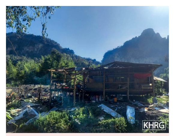
This photo shows a house damaged by SAC air strikes and indiscriminate shelling launched in Kaw T'Ree Township, Dooplaya District in November 2022.

On top of the aforementioned scapegoating of civilians, linked with historical patterns of abuse committed by the Burma Army in ethnic regions, villagers have described SAC soldiers regularly targeting civilians following armed clashes between the SAC and armed resistance groups. This pattern is widespread: half of the field documents consulted for this report describe attacks against civilians that took place following nearby armed clashes, and half of the interviewees shared information where retaliatory attacks followed this same pattern. In all of those instances, SAC soldiers retaliated against the wrong actors, i.e. villagers, instead of the EAGs that led the operations.