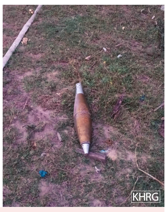
These two photos were taken on March 23rd 2022 in Taung Kyar Inn village, Nga Pyin Ma village tract, Kruh Tuh Township, Dooplaya District, following SAC indiscriminate shelling in the village. They show a house that was damaged in the shelling, and an unexploded artillery shell.

Several interviewees illustrated the impact of this strategy through travel restrictions and stealing at SAC checkpoints. Villagers are often forbidden from transporting large quantities of rice, as soldiers suspect them of providing it to local armed groups.<sup>34</sup> Saw Aa---, a displaced villager in Bb--- village, Ma Htaw village tract, Dwe Lo Township, Mu Traw District, stated: "[After the coup,] BGF <sup>35</sup> were afraid that KNLA would retrieve information from the villagers and they were also afraid that villagers would offer KNLA soldiers rice if they allowed villagers to travel. That was the reason the BGF put travel restrictions over villagers." The consequences of such restrictions are devastating for