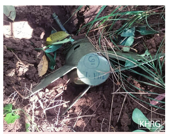
This photo was taken on December 16th 2022. It shows an unexploded bomb following an SAC air strike launched on December 15th 2022 in Htaw Ta Htoo Township, Taw Oo District.

The most common forms of SAC retaliation against villagers following nearby armed clashes are indiscriminate shelling and airstrikes towards villages. The Burma Army regularly fails to distinguish between armed actors and civilians, or military and civilian targets, as they strike villages proximate to the location where SAC soldiers are attacked. As Saw Ac---, a villager from Bd--- village, K'Ser Hkler area, K'Ser Doh Township, Mergui-Tavoy District, explained: "[Since the coup,] there is no direct shelling into the village if conflict [skirmishes between SAC and armed resistance groups] doesn't happen. The shelling usually happened when armed conflict happened around the area. We could hear the shelling sound from afar. As soon as fighting happens, there will be shelling [in nearby areas] every night."