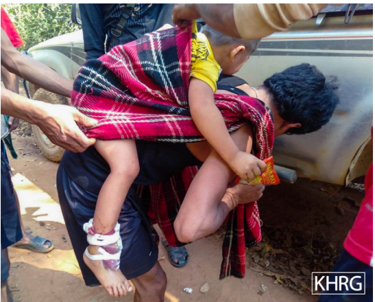
These pictures were taken on March 5th and 6th 2022. They show villagers who were killed and injured due to SAC shelling in Bm--- village, Meh K'Law village tract, Bu Tho Township, Mu Traw District. The attack followed armed clashes in the area. Seven villagers, including three children and one pregnant woman, were killed [picture on the left] and four injured in the shelling.

In these cases, SAC soldiers aimed to keep allegedly rebellious villagers under control and to strengthen their rule over certain areas. As Saw Ah---, a village elder from Bh---village, Bh---village tract, Moo Township, Kler Lwee Htoo District, stated: "I think, they did it [committed human rights violations] having a purpose, a plan in mind. I do not think that they did it randomly. They want to hold power and take over power [from civilians] so they did it [all human rights violations] just for maintaining their power so that their [SAC] regime will be long-lasting. People should not be killed and threatened, but they [SAC] killed and threatened those people anyway. This is what they committed after the coup. They threatened villagers and put villagers in fear."