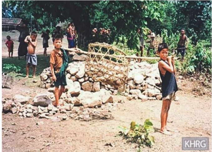
Children, mostly aged between 7 and 13 years old, gathered 300 piles of stones for the construction of a road from Kyaik Khaw (Thein Seik) to Wee Raw village in May 2004.

KHRG has repeatedly emphasized that more children are dying and suffering from structural violence committed by the military regime than directly killed by armed conflict.