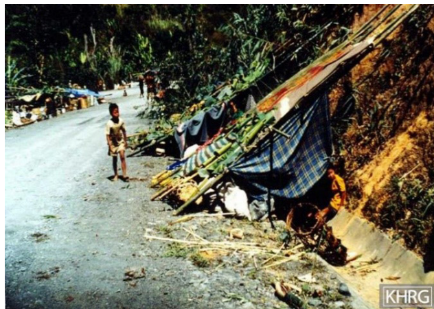
About 6,000 newly-arrived Karen refugees from Dooplaya District camped along the roadsides and in the drainage gutters at Ka Hee Pa Leh in Thailand in mid-February 1997. Thai authorities would only allow them to set up shelters along the road.