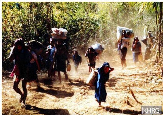
Karen villagers from Dooplaya District are shown running for their lives with whatever they can carry across the Thai border in mid-February 1997. As these villagers ran, attacking forces were just a half hour’s walk away.