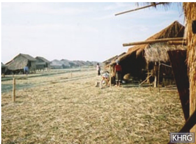
The barren landscape of Plaw Law Bler relocation site, Kler Lwee Htoo District where soldiers forcibly relocated villagers in April 2006. Villagers at Plaw Law Bler complained about the scarcity of water, lack of arable land and movement restrictions.