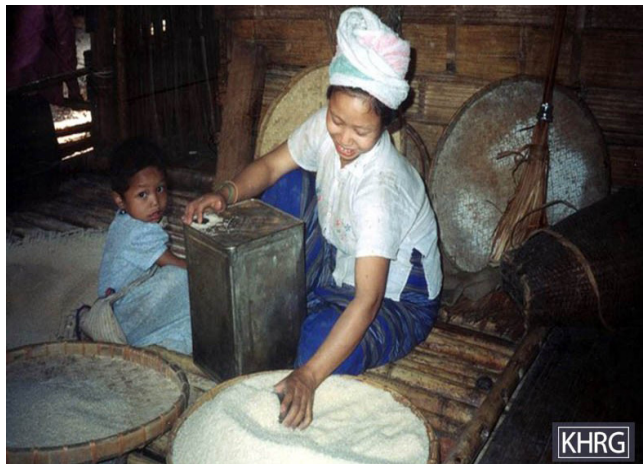
This woman from Mu Traw District is putting her rice into tins to hide it for the next time SPDC soldiers come to the village. The SPDC entered the village one or two days previously and had taken much of the villagers' rice, clothing and other belongings.