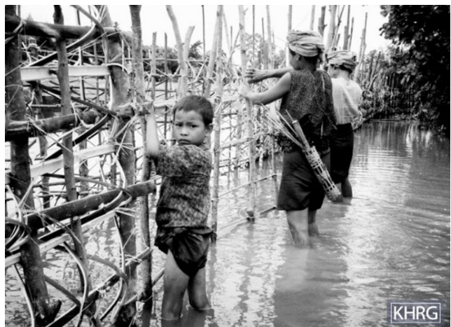
In August 2006, all of the villages and relocation sites under State Peace and Development Council (SPDC) control in Moo Township, Kler Lwee Htoo District were ordered by SPDC Light Infantry Battalion (LIB) #599 to build fences around their villages.