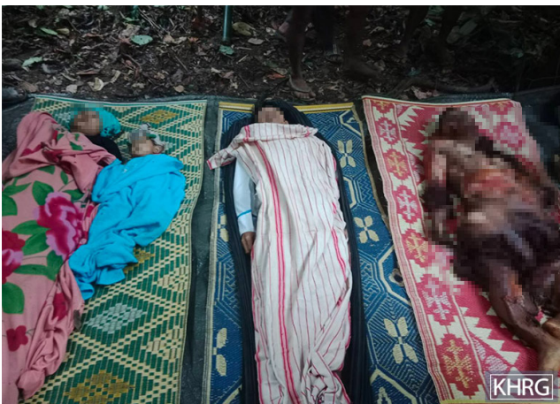
This photo was taken on January 13 th 2023 in Zh--- village, Pay Kay village tract, Lu Thaw Township, Mu Traw District. On January 12 th 2023, four SAC fighter jets conducted an air strike on Zh--- village. The fighter jets dropped eight bombs, and six of them fell onto Zh--- village. The other two bombs fell beside the village. Five villagers, including a 3-year-old infant, were killed, and two villagers were injured. This photo shows four villagers, including the 3-year-old baby, who were killed by the air strike.