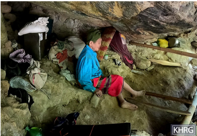
This photo was taken April 2021 in a cave in Lu Thaw Township, Mu Traw District, where villagers from Day Bu Noh area, Pay Kay village tract were seeking refuge after the SAC bombarded on March 27 th 2021. The picture shows an elder woman, who was over 100 years old at the time of displacement, sheltering in a cave.