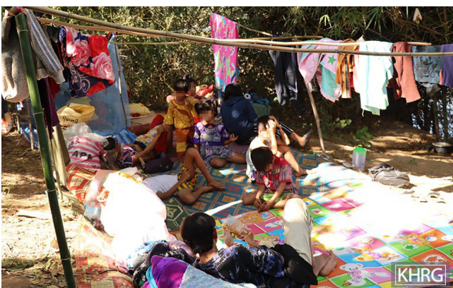
This photo was taken in December 2021. It shows displaced villagers from T1--- village, in Tm--- IDP site, Palu village tract, Kaw T'Ree Township, Dooplaya District, near the Thai-Burma border. Approximately 1,000 villagers from Palu village tract, including Lay Kay Kaw area, fled after the SAC conducted ground and air attacks in the area on December 15 th 2021, following fighting between combined SAC and BGF troops against KNLA troops in Lay Kay Kaw area.