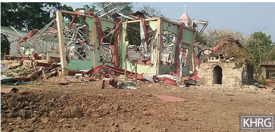
This photo was taken in April 2023 in We--- village, Noh Poe village tract, Kaw T'Ree Township, Dooplaya District. It shows a Karen Baptist church in We--- village, destroyed by a bomb from an SAC air strike on April 11 th 2023. The air strike also destroyed a village school and villagers' houses.