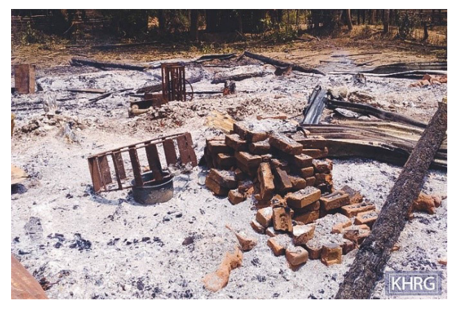
This photo was taken in April 2021 in Day Bu Noh village, Pay Kay village tract, Lu Thaw Township, Mu Traw District. It shows the destruction of villagers' houses and belongings as a result of SAC airstrikes on March 27<sup>th</sup> 2021.