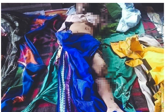
This photo was taken on March 1st 2021 in Kt--- village, Kheh Kah Hkoh village tract, Ler Doh Township, Kler Lwee Htoo District. It shows the body of one of two victims who died in a landmine explosion on March 1st 2021.