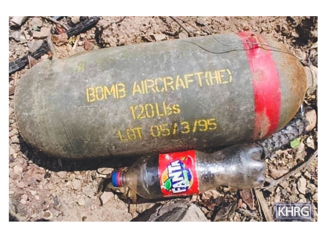
This photo was taken in April 2021 in Bu Noh village, Pay Kay village tract, Lu Thaw Township, Mu Traw District. It shows an unexploded high explosive (HE) bomb that was dropped during the SAC airstrikes on March 27<sup>th</sup> 2021.

• It is extremely difficult to estimate the total number of displacements due to conflict since the February 1st military coup. UNHCR, which is working on relief operations, estimated 47,700 in Kayin State, and another 1,100 in Mon State. The figures are likely much higher given the poor access to IDP sites and displacement information in many areas, and the variable nature of displacements, which can be recurring or extended, and can vary from several days to several months or longer.