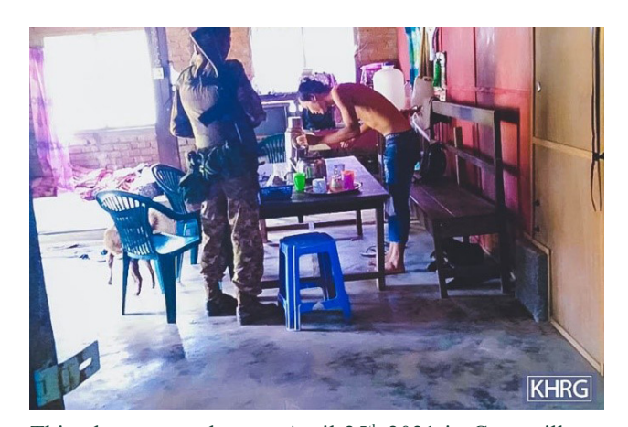
This photo was taken on April 25<sup>th</sup> 2021 in Ce--- village, Ce--- village tract, Thandaunggyi Township, Toungoo District. When SAC LIB #730 took security for the road, SAC soldiers entered villagers' houses and asked them for food. Villagers complied out of fear that the soldiers would do something bad to them.