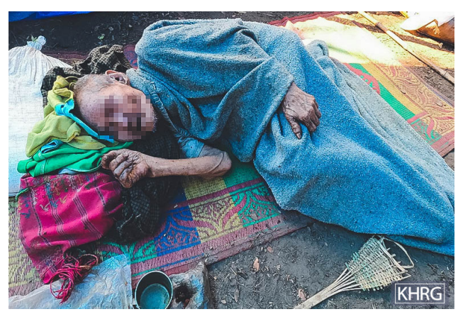
This photo was taken on April 11<sup>th</sup> 2021 on the Thai side of the Salween River. The villager in the photo is one of the IDPs hiding in the forest. This old man is over 100 years old, and is ill. He is covered by a dirty blanket and lying on a thin mat. No one was able to take care of him as his wife was also very old. A few weeks later, he passed away.

One of the biggest problems continues to be access to aid. Due to both COVID-19 and increased insecurity following the coup, many international stakeholders are no longer operating on the ground in some areas. Even attempts by local stakeholders to provide support to IDPs have met with opposition by the SAC.