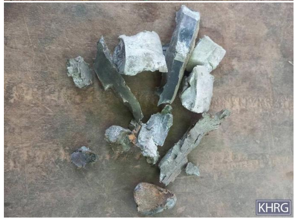
These photos were taken in March 2025, in Tk--- village, Hawh Hkoh Ghaw village tract, Moo Township, Kler Lwee Htoo District. On 3 March 2025, at 8:35 pm, Burma Army Light Infantry Battalion (LIB) #351, based in Ler Doh army camp, fired two 120 mm mortar shells into Tk--- village, and the mortar shells landed in the garden of a Tk--- villager named Saw K---. The four photos above show the tractor and the motorbike of Saw K---, which were damaged by the shelling. The next two photos show containers of diesel and rice sacks, which were also damaged by the shrapnel of the explosion. The photos in the last row show the tails and shrapnel of the mortar shells that landed and exploded in Saw K---'s garden.

On 3 April 2025, SAC soldiers from LIB #351, based in Ler Doh army camp, indiscriminately fired two 120 mm mortar shells into Tk--- village, causing destruction. Because the SAC soldiers deliberately targeted the village [a belief held by villagers due to the fact that armed resistance groups occasionally pass through the village] and fired a mortar into the village, the mortar shell landed and exploded on the house of a villager from Tk--- village named Naw 12 M---. None of