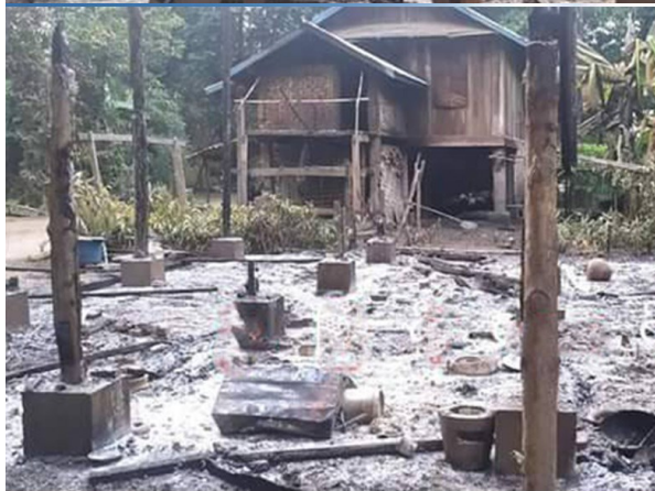
KHRG received these photos from a local villager in March 2024. The photos show some villagers’ houses that SAC troops burned down in A--- village, Htee Day village tract, Daw Hpah Hkoh Township, Taw Oo District, on November 12 th 2023.