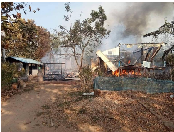
This photo was taken on February 2023, in Q--- village, Pyay Yay (Pyayeyin) village tract, Hsaw Htee Township, Kler Lwee Htoo District. This photo shows the burning of the house owned by U V--- and Daw D---, that was set on fire by a mortar explosion that SAC LIB #20 shelled on February 23 rd 2023, at 3:30 pm.

[On February 23 rd ,] SAC soldiers set up six 120 mm mortars [artillery weapons] in S--- village [controlled by the SAC]. That afternoon, they [also] set up mortars [artillery weapons] in several villages such as in Y---, P--- and W---, in Ain Waing village tract, Hsaw Htee Township. The [SAC] [also] sent military troops to F--- village. The SAC sent approximately 150 soldiers from Light Infantry Divisions (LIDs) 9 #44, #77, and #66. At around 4 pm, they [the SAC] shelled two mortar shells again [direction unspecified].