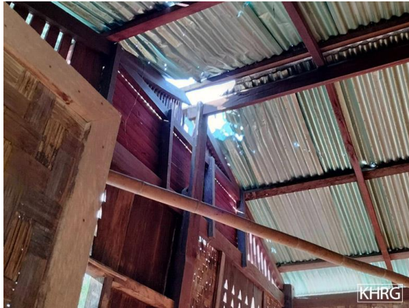
This photo was taken in November 2023 in N--- village, Day Loh Mu Nu village tract, Htaw Ta Htoo Township, Taw Oo District. It shows the roof of a house owned by Ak--- damaged by SAC shelling on November 19 th 2023.

On November 27 th 2023, the SAC troops indiscriminately fired rounds of mortar into villages in Day Loh Mu Nu village tract. One of the mortar shells landed in a rubber plantation owned by a villager near Af--- village. It exploded and damaged the rubber plantation. There were no casualties [caused by the shelling] in this village.