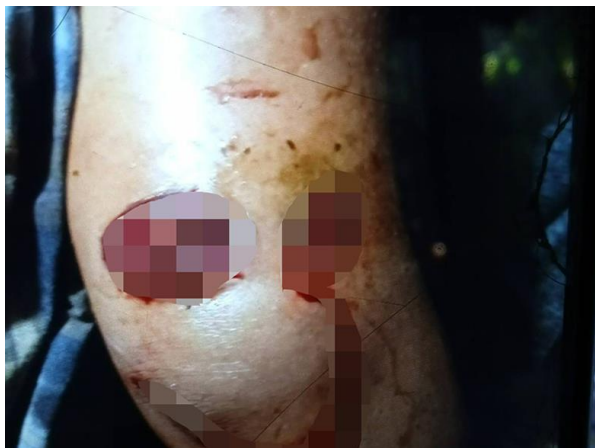
A KHRG researcher received this photo from a local leader of Day Loh Mu Nu village tract, Htaw Ta Htoo Township, Taw Oo District, on November 30 th 2023. It shows Naw Al---'s injured elbow after she was hit by shrapnel from a mortar shell explosion. Naw Al--- was injured when the SAC fired mortars into Ag--- village, Day Loh Mu Nu village tract.

On November 27 th 2023, at 3:17 pm, the SAC conducted an air strike in Ah--- village, Day Loh Mu Nu village tract. The air strike injured two villagers, one of whom was seriously injured. A villager's house was also damaged by the air strike.