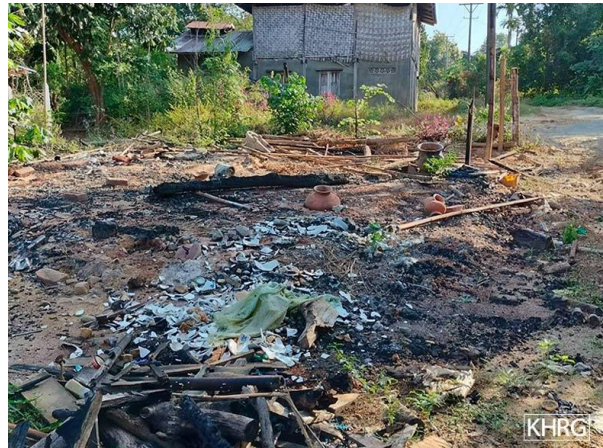
These four photos show villagers' houses which were burned down by the SAC troops, including Infantry Battalion (IB) #39, in A--- village, Day Loh Mu Nu village tract, Htaw Ta Htoo Township, Taw Oo District, on September 14 th 2023.

On October 20 th 2023, SAC combined forces, including IB #39, went to N--- village, Day Loh Mu Nu village tract, where they burned down three villagers' houses. The owners of those houses are Saw O---, Saw P--- and Saw Q---.