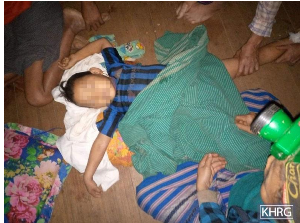
These photos were taken on March 5 th 2022 in W--- village, Meh K'Law village tract, Bu Tho Township, Mu Traw District. The photos show villagers who were killed or injured during the SAC shelling.