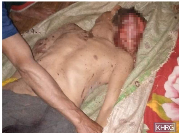
These photos were taken on March 5 th 2022 in W--- village, Meh K'Law village tract, Bu Tho Township, Mu Traw District. The photos show villagers who were injured or killed during the SAC shelling.