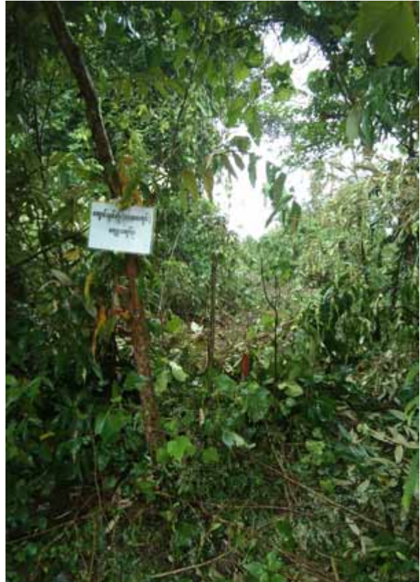
This photo was taken on August 13th 2019 in Y--- village, Htoh Kaw Koe village tract, Ta Nay Hsah Township, Hpa-an District. It shows the sign put by the KNU/KNLA-PC on the confiscated land beside the victim's farm.

Further background reading on the issue of land confiscation by the KNU/KNLA-PC in Southeast Myanmar can be found in the following KHRG reports: