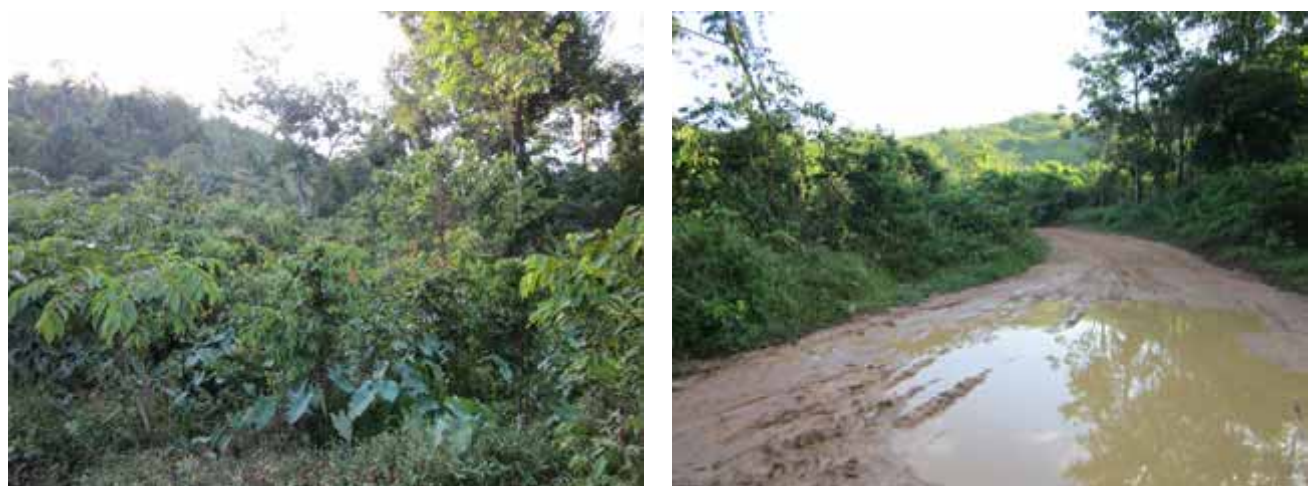
The above photos show a road and the landscape of the area where water for the dam will be diverted through. [Photos: KHRG]

The above photos were taken in Htee Ler Klay village and show changes to the local landscape from the dam project. The top four photos show how the hillside has been dug out to widen the channel for water to flow, but the bottom two demonstrate that the project site itself is above much of the surrounding area. That land will flood when the dam is completed, which will destroy land where local people in Htee Ler Klay work for their livelihood. [Photos: KHRG]