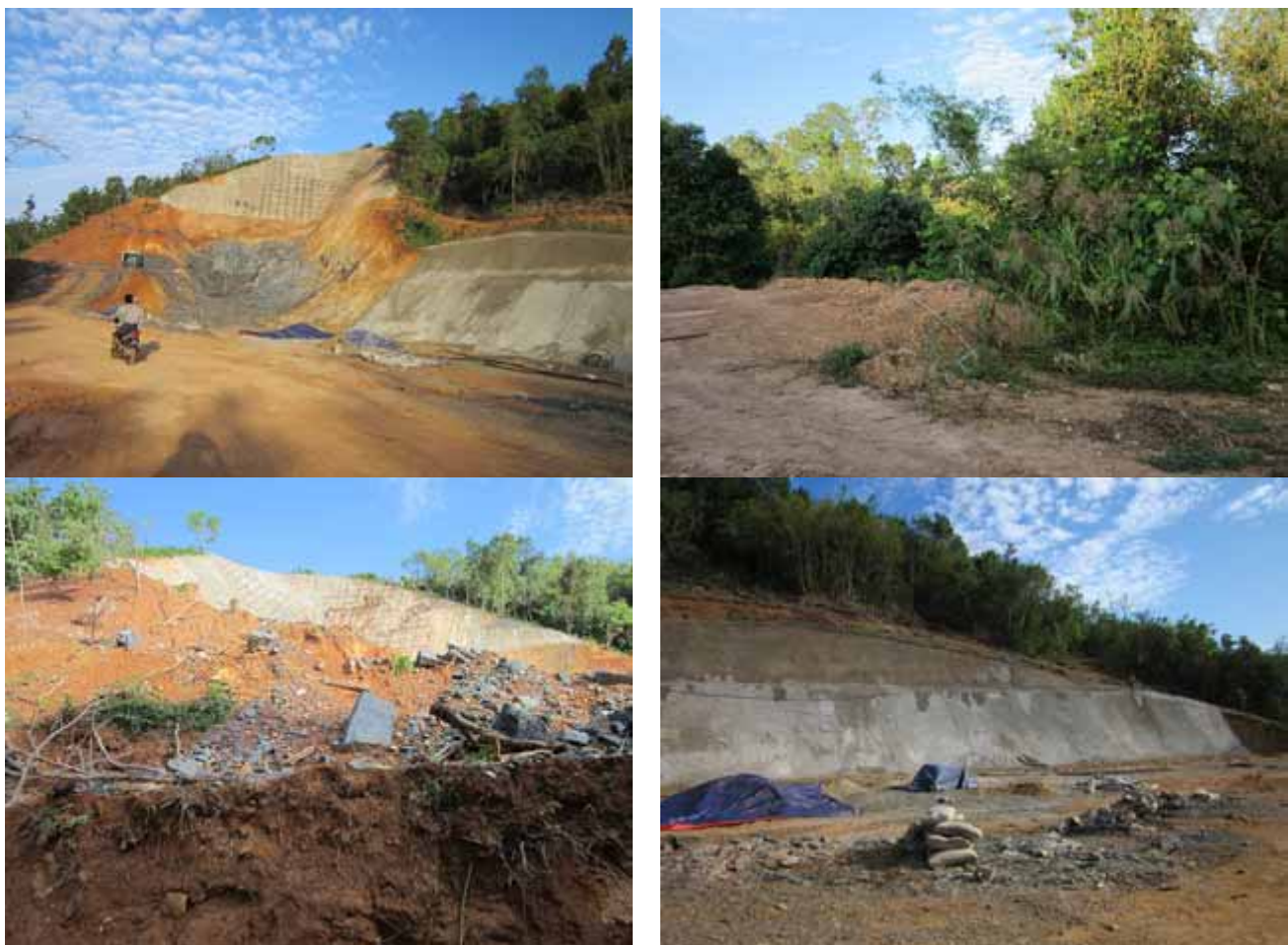
The above photos show the downstream wall of the dam that is being constructed in Htee Ler Klay in the A'Nya Pyah area.

The photos below were taken on April 7<sup>th</sup> 2012 by a community member trained by KHRG in K'Ser Doh Township, Mergui-Tavoy District, and show different views of the A'Nya Pyah Dam construction site and surrounding area.