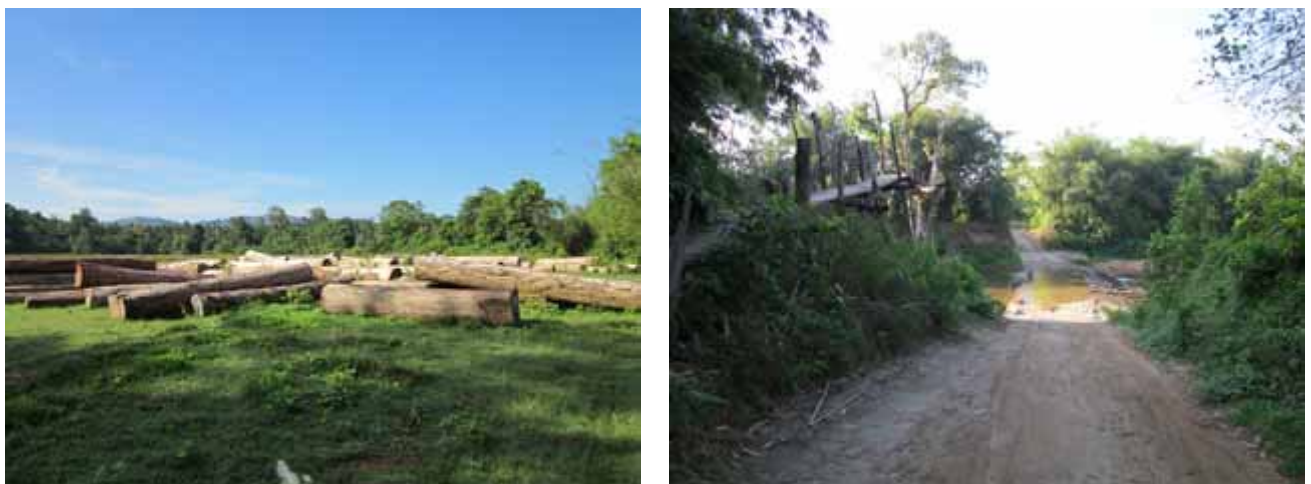
The photo on the leftshows additional logs that the Burma Logging Company stored between Htee Ler Klay and A'Nya Pyah villages. The photo on the right shows the vehicle road that links U Yay Kyee, Htee Ler Klay, A'Nya Pyah, Hsay Hklaw and Nyaw Hklaw villages.