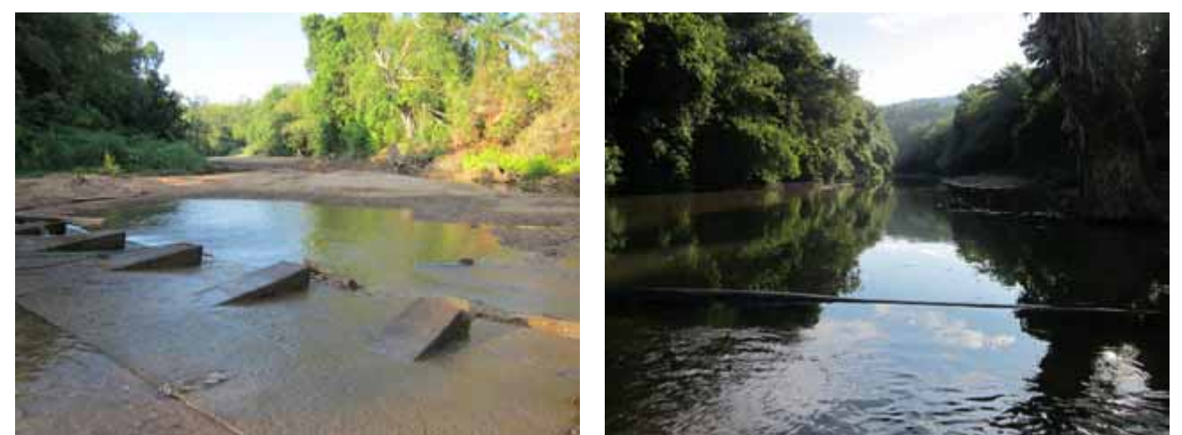
The photo on the left is of the Htee Ler Klay River and the photo on the right is of the P'Ka Yee River, both of which are above the dam and will flow into the reservoir for the dam.