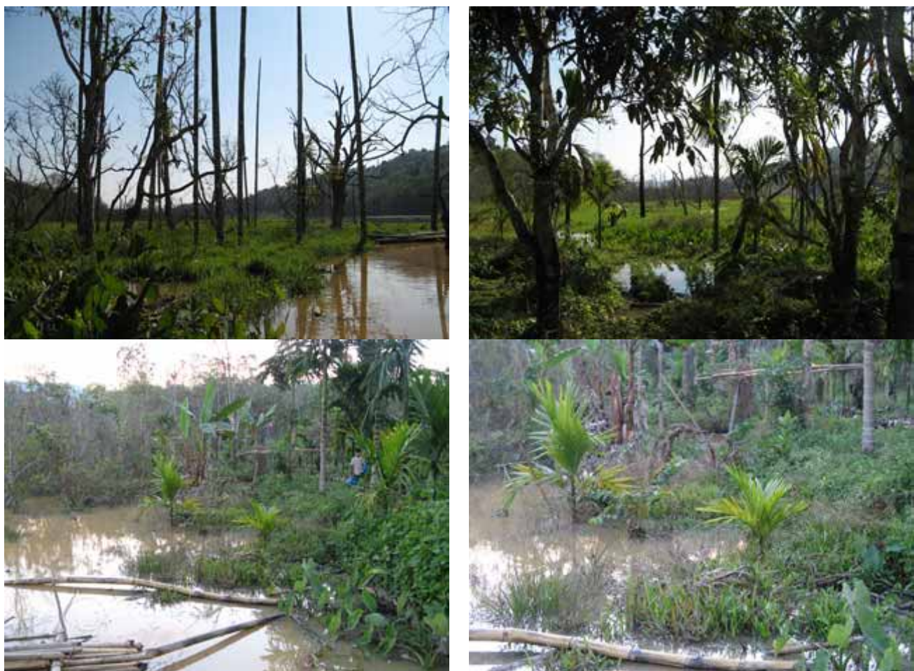
The above photos were taken in Hkay Too Hkee village, and show flooding of a villager's betel nut plants and surrounding plantation land caused by a Thai mining company.

Further background on the current situation in Mergui-Tavoy District can be found in the following KHRG reports: