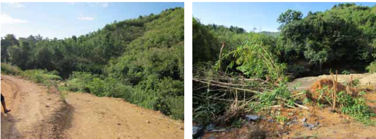
The photos show the side of the river opposite from the construction site.