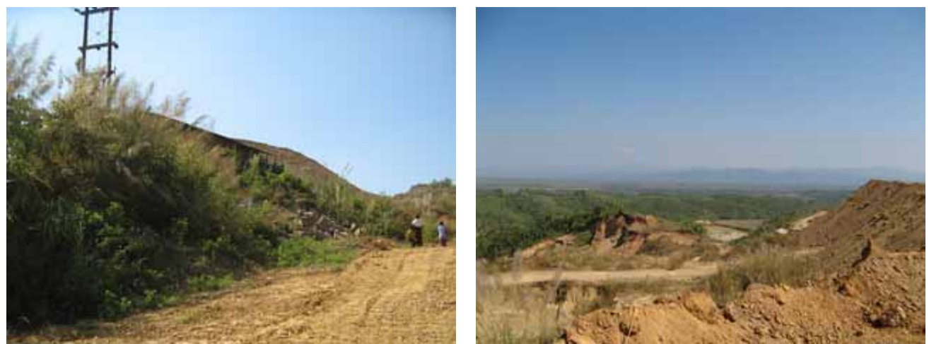
The top four photos above show different views of abandoned operations in Hkay Ta Mine, where metal was extracted from ore using an acid bath and other chemical agents. The bottom four photos show the area surrounding Hkay Ta Mine, in relation to the mountains.