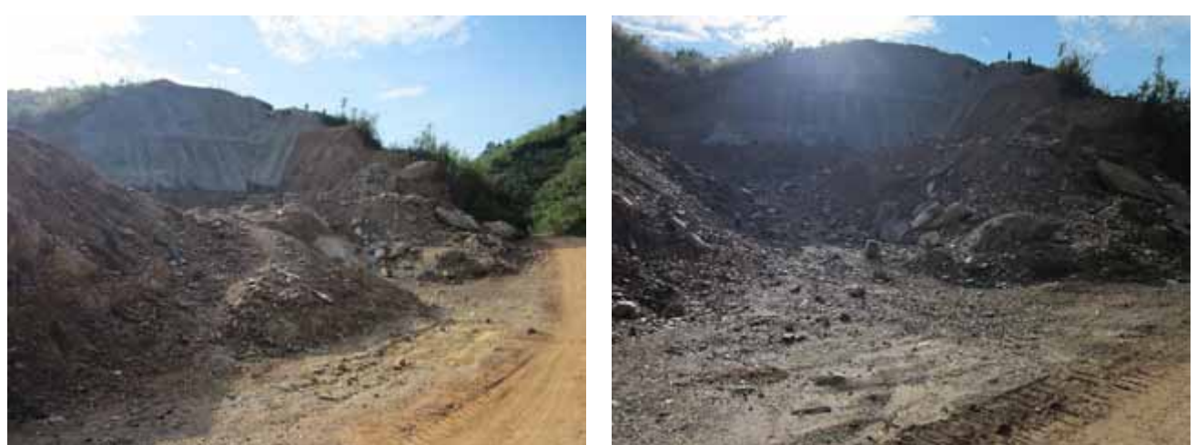
The above photos show the upstream wall of the dam, where the Htee Ler Klay and P'Ka Yee rivers will be diverted through the project site. [Photos: KHRG]

The above photos show shelters on the upstream side of the dam site, where workers are housed. [Photos: KHRG]