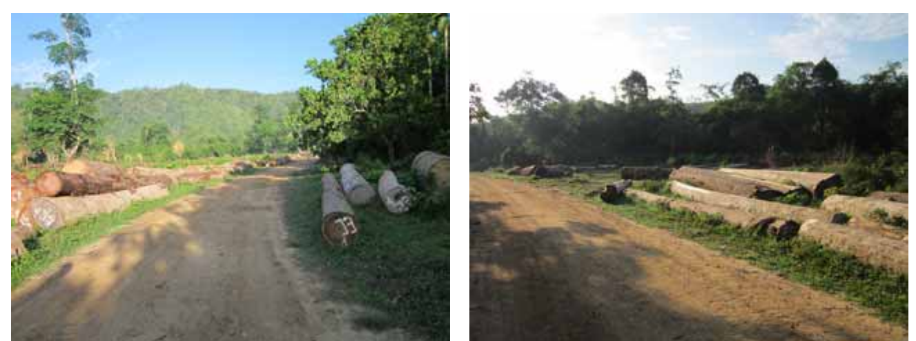
The above photos show logs that were cut down by the Burma Logging Company, and are being stored in U Yay Kyee

The photos below were taken on April 7<sup>th</sup> 2012 by a community member trained by KHRG in K'Ser Doh Township, Mergui-Tavoy District, and show different views of logging activities in A'Nya Pyah, U Yay Kyee and Htee Ler Klay villages.