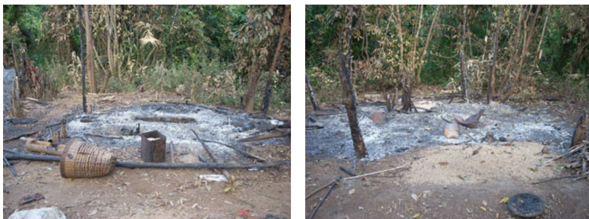
The photos above show the remains of burned homes at one of the hiding sites in the Th'Ay Kee area attacked by Tatmadaw MOC #4 soldiers between December 1 st and 10 th 2007. A KHRG researcher took these photos on December 6 th 2007, two days after this site was attacked, while accompanying families who returned to attempt to retrieve food and other essential property left at their homes when they fled the attack.

the same time period. KHRG's documentation indicates that these battalions attacked on civilian communities, destroyed villages and agriculture and killed villagers in Toungoo, Nyaunglebin, and Papun districts during the last months of a major Tatmadaw offensive, which spanned the years 2005 to 2008 and took place in northern Karen State and eastern Bago Region.