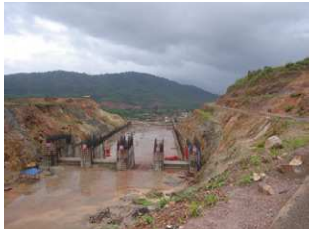
The photo at left shows the Shwegyin River as it runs its normal course. The photo at right shows the uncompleted Gkyauk Ner Gha dam project. The hills on both sides of the second photo used to be home to lime trees cultivated by local villagers.