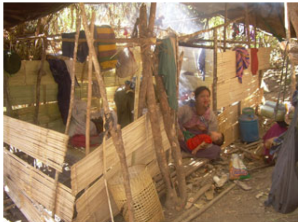
Having fled to escape a series of attacks on villages in the Th'Ay Kee area by soldiers from SPDC MOC #4 at the start of December 2007, the villagers shown here on January 21 st 2008 subsequently built this makeshift shelter at a forest hiding site.

Faced with a resistant civilian population which continues to evade military control in the forested mountains of Toungoo District, the SPDC has been unable to locate all displaced communities in hiding. On those occasions when they have been able to locate a given hiding site, local villagers have often been able, through the use of local communication networks and advanced warning systems, to escape into the forest before the arrival and armed attack of SPDC troops. As a consequence, while the army has continued to locate, shell and raze displaced hiding sites, many other communities go undetected. Therefore, KHRG field researchers have reported that SPDC forces operating in southern Toungoo District have since late 2007 begun sending spies, under the guise of escaped convict porters, into displacement areas in an attempt to track down communities in hiding and pass information on their locations back to local SPDC Army units which can then more quickly advance onto hiding sites and thereby reduce the time in which villagers are able to flee. As a KHRG field researcher described the situation in March 2008,