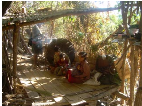
Displaced villagers from S--- dare not stay in their village because SPDC soldiers are active in the area. Instead, they have had to build temporary shelters at their hiding site as shown here on January 19 th 2008.