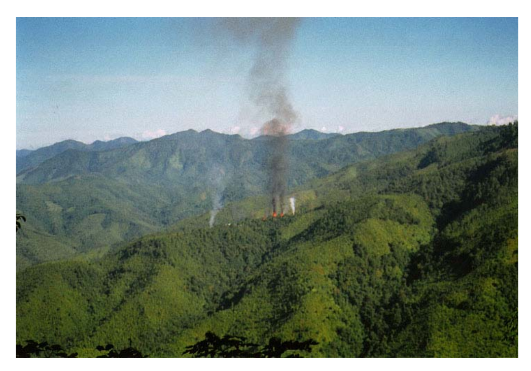
This photo, taken around 10:00 am on November 28<sup>th</sup> 2005 from a neighbouring ridge, shows Hee Dhaw Khaw village engulfed in flames after being torched by SPDC Army soldiers from Infantry Battalion (IB) #75. The fire raged for four hours. Some of the villagers watched their village go up in flames from this nearby ridge.

range of Hee Daw Khaw at approximately 4:00 pm, the soldiers opened fire on the village with mortars and small arms without provocation or prior warning. Startled by the sudden hail of shells and bullets, the villagers immediately ran for their lives with little more than what they were wearing. The villagers did not have time to take any food or any of their possessions. So unexpected and sudden was the attack that some villagers had even forgotten their young children in the confusion. Soon realising their mistake, these villagers had to return to the village where they risked being shot to collect their children before continuing to flee along with the rest of the villagers.