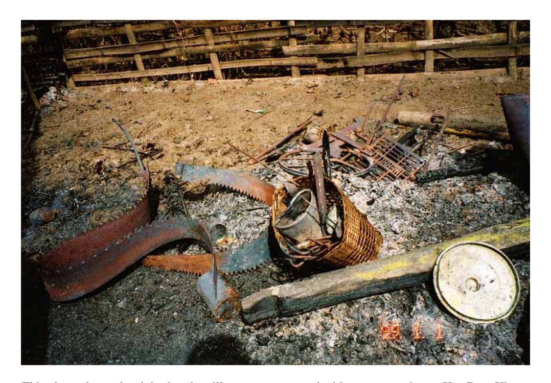
This photo shows the sight that the villagers were greeted with upon returning to Hee Daw Khaw village on December 3<sup>rd</sup> 2005 to see what they were able to salvage. In the photo you can see two buckled blades for a two-person tree saw, mangled storage tins, and the destroyed workings for a pedal-operated table sewing machine in the background. [kindly disregard the incorrect date stamped on the photo]

KHRG researchers within the district are reporting that they do not foresee any end to these or similar attacks in the near future. One researcher stated that he had heard that the SPDC planned on continuing these attacks right up until the beginning of the rainy season in June 2006. If this proves to be true, one can expect many more IDPs fleeing into the forests where they will be plagued by a lack of physical security, food shortages, and illness. Many of this number who, like those who have already made the arduous journey, find life in the forest too difficult to bear may risk the long and dangerous journey to one of the refugee camps in Thailand, where even should they manage to avoid detection by the SPDC and DKBA soldiers who are intent on stopping them, they risk being arrested by Thai authorities before they can even reach one of the camps.