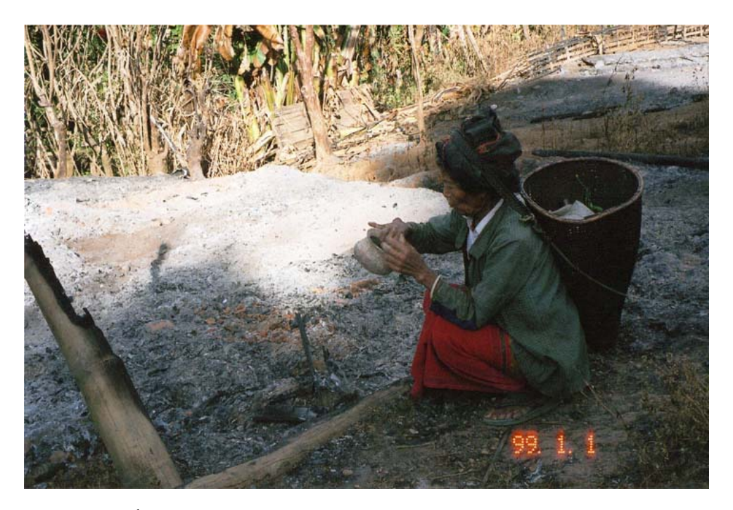
On December 3<sup>rd</sup> 2005, the villagers returned to Hee Daw Khaw to salvage what they could from the remains of what were once their homes. Very little survived the fire, so these villagers must now rebuild their lives from scratch. Some of the men managed to recover some of the mangled tin roofing which they will use to rebuild their homes. Others, such as this woman found a small pot that survived the fire. [kindly disregard the incorrect date stamped on the photo]