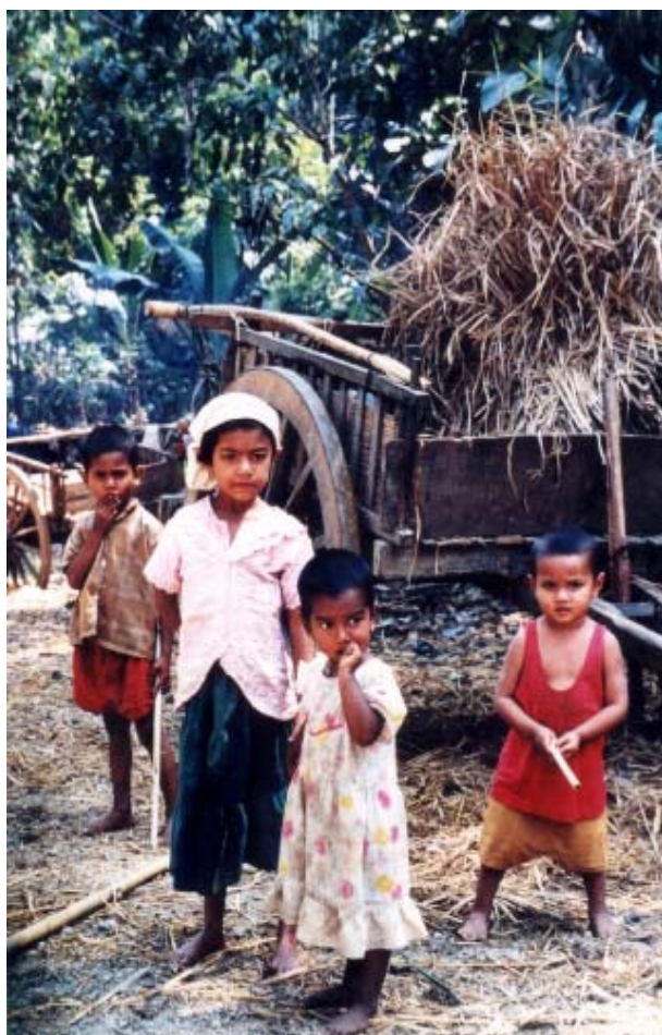
Muslim children at their temporary roadside refugee camp in Thailand after they fled with their families from the SLORC's 1997 Offensive in Doooplaya District.