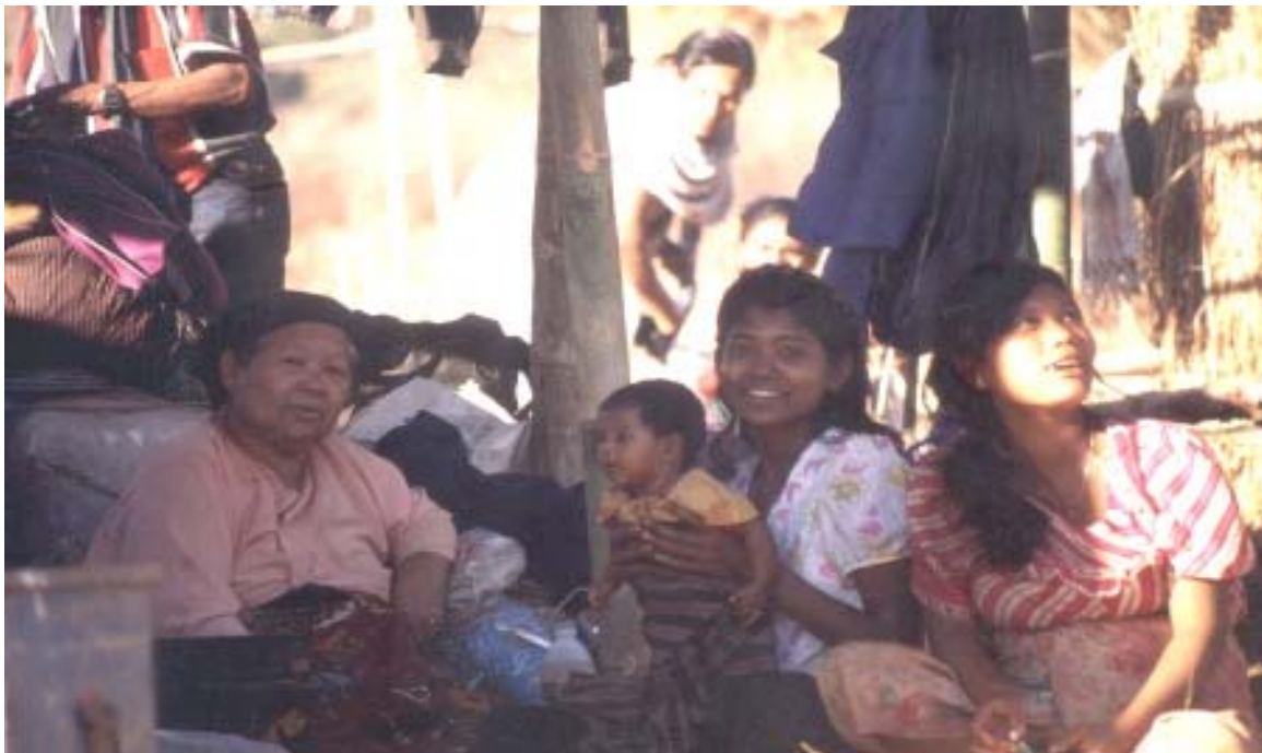
Muslim women in a temporary shelter they built after fleeing from SLORC troops in Dooطلا District in 1997.

“Living in our place is the best, even with whatever pressure they put on us. Here [in Thailand] is the same. We don’t have work permits so it is difficult for us to work. Some of the bosses don’t dare to call us if we don’t have work permits. They only make work permits for the old people [people who have been in Thailand for a while] in Thailand. They don’t make them for the new people either.” - “Khin Kyaw Mya” (M, 28), Muslim villager from xxxx town, Rangoon Division (Interview #3, 2/02)