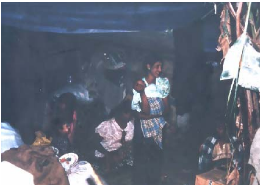
Muslim villagers from Doooplaya District who fled their homes during the SLORC’s 1997 Offensive.

“An unknown writer issued many books to block the development of the religion of Islam. The book contains writings on ‘Sa Ti Kya Thakin Ma’ [‘The Master’s Daughter’s Servant’; an attempt to link the Muslims with Aung San Suu Kyi since she is the daughter of a Thakin, as her father, Aung San, was known], how the people from India arrived in Burma [referring to their arriving