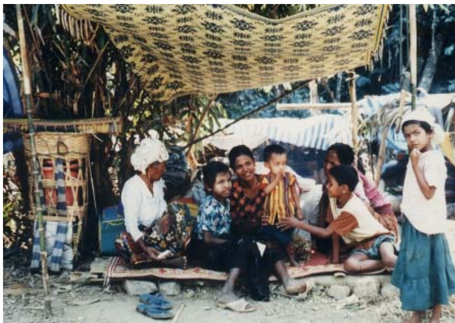
Muslim villagers who fled to Thailand following the SLORC's 1997 Offensive in Dooplaya District.

The anti-Muslim violence in 2001 was the most widespread since 1997. The riots in 2001 may have been intended to draw the public's attention away from the plummeting value of the Kyat coupled with spiralling inflation, food shortages, and the lack of progress in the SPDC's talks with Daw Aung San Suu Kyi. They took place in various cities at different times from February until October 2001; first in Sittwe town of Rakhine State in early February, then Toungoo (Pegu Division) in March and again on May 15-17, Kyaukpyu (Rakhine State) on May 14 th , then Prome (also known as Pyi, in Pegu Division), Pakokku (Magwe Division), Pegu (Pegu Division), Henzada (Irrawaddy Division) and other towns throughout October. There were also reports of orchestrated anti-Muslim violence in Tantabin, Zayat Gyi, Oak Twin, Pyu, Yedashi, Sein Ywa, and Kyauk T'Ga (all near the Nyaunglebin-