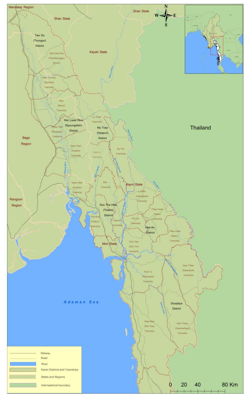
Locally-defined northern and southern Karen districts (Kayin and Mon states; eastern Bago region)