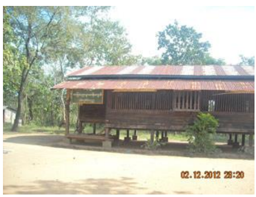
These two photos were taken on December 4<sup>th</sup> 2012 by a KHRG researcher in D--- village, Yaw Kuh village tract, Nabu Township, Hpa-an District. The photo on the left shows a small shop where the

<sup>28</sup> KHRG did not publish a single report regarding drugs in the five years before the ceasefire, but has received dozens of reports since the ceasefire.