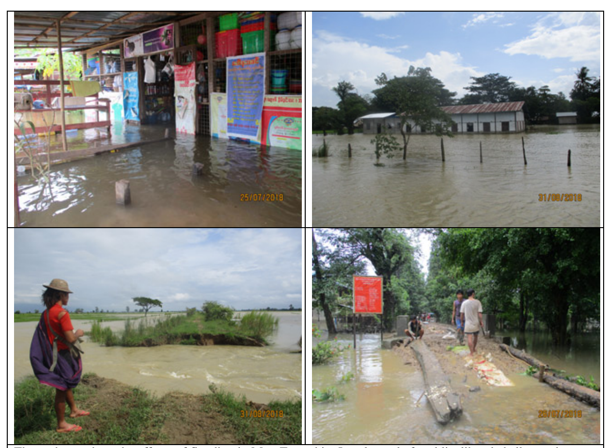
These photos show the effects of flooding in Moo Township. Local people faced livelihood challenges because their farms were flooded. Poor road conditions and the collapse of many local bridges also made it difficult to travel between July and August 2018.

Further background reading on the situation in Nyaunglebin District can be found in the following KHRG reports: