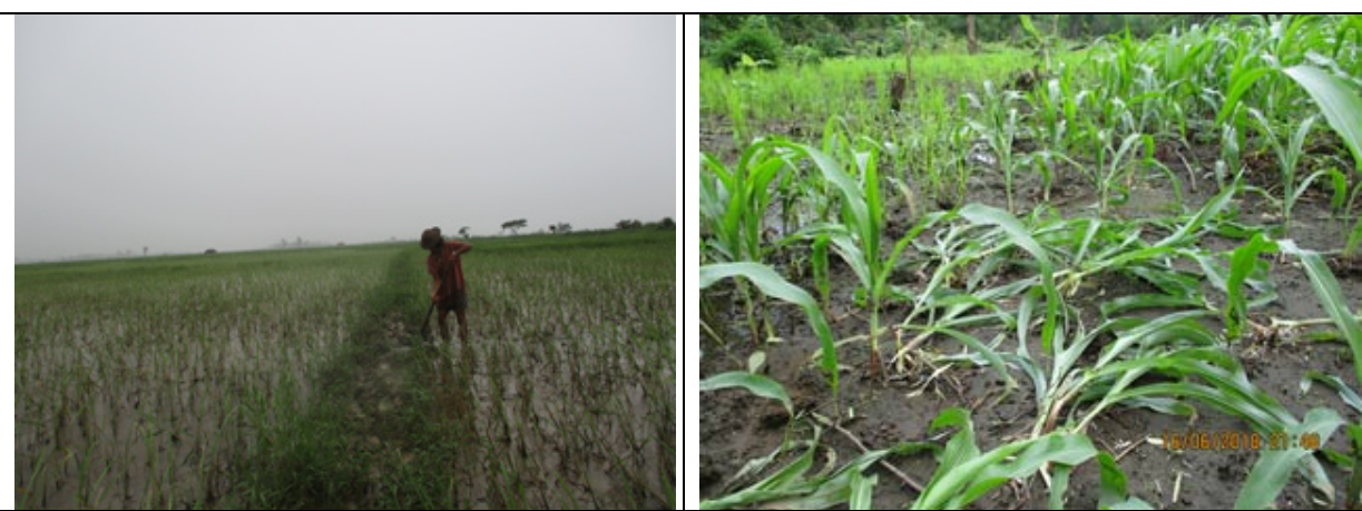
The photo on the left shows a villager from Way Sway (Moo Township) taking care of his paddy field that was damaged by the flooding in August 2018. The photo on the left shows how a corn farm in Thaw T'Kuh was damaged by a rodent infestation in June 2018.

In the lowlands, a lot of fields were flooded following heavy rains in July and August 2018. This problem affected 350 fields in Way Sweh, T'Kaw Pwa village tract, and 814 fields in T'Kaw Pwa village. Local farmers did not receive support from the government, and some also had to abandon their farms because rodents ate their crops. Two NGOs, the Christian Social Service and Development Department and Samaritan's Purse, provided them with clothing, drinking water, water purification tablets and tarp. Because of the decrease in production caused by the flooding, some farmers had to borrow money to overcome their economic difficulties. This situation also threatened the livelihood of local people who were engaged in trade, because it led to an increase in the price of goods when the kyat is already losing value.