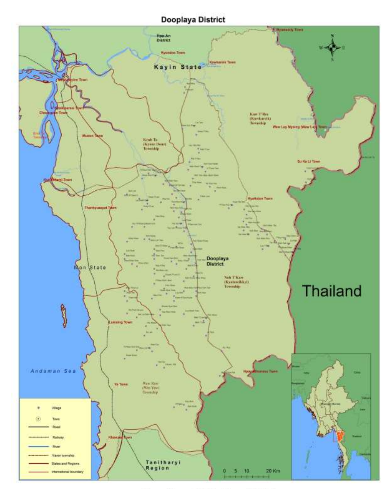
Karen Human Rights Group (KHRG)