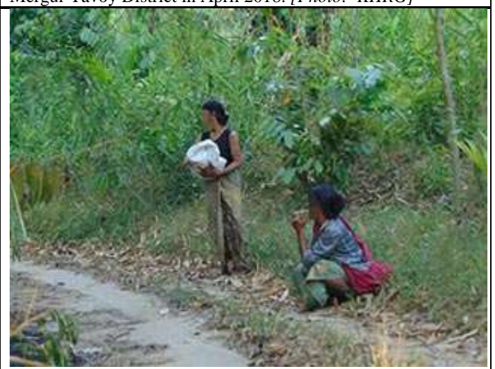
Two Mon villagers stop on their way to work. They are afraid of soldiers patrolling near their village. The MNLA told Mon villagers to sit down when they see soldiers, to keep a low profile. [Photo: KHRG]

A group of soldiers from the border security force from KNLA are seen patrolling the border between Dooplaya District and Mergui-Tavoy District in April 2018. [Photo: KHRG]