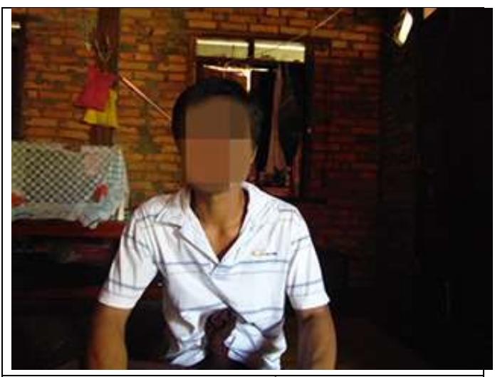
This photo was taken on April 12<sup>th</sup> 2018. It shows a mahout from Man Aung village. He was one of the civilians arrested by the MNLA for illegal logging in January 2018.

Tensions continued to escalate between the KNLA and the MNLA, leading to an outbreak in fighting.