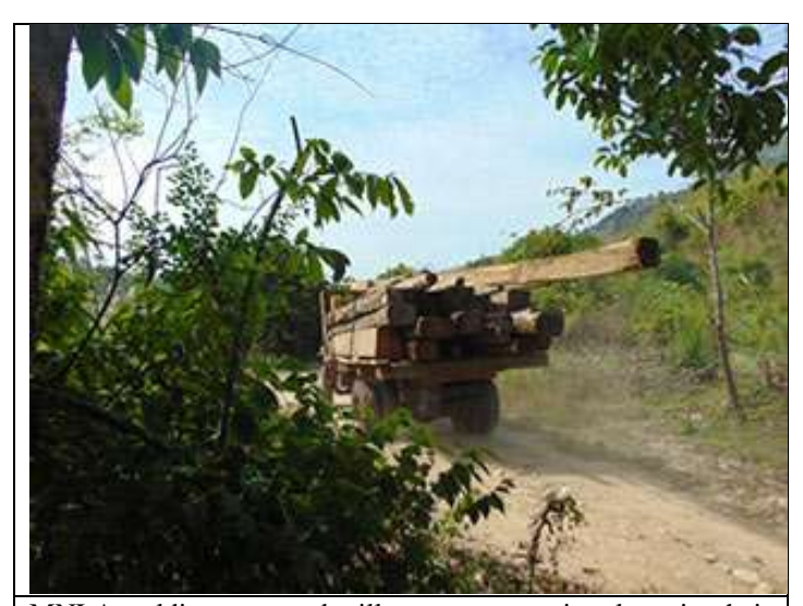
MNLA soldiers arrested villagers transporting logs in their truck when a logging dispute led to skirmishes between the MNLA and KNLA.

Disputes between the KNLA and MNLA relating to land in Tanintharyi Region date back to 1988. After the ethnic armed groups participated in negotiations mediated by the National Democratic Front, a coalition of ethnic groups, they agreed to stop fighting. After more than 20 years of stability, skirmishes between the MNLA and KNLA resumed in December 2016.<sup>3</sup> when clashes occurred near Mann Aung because of disputes over natural resources and territory.4