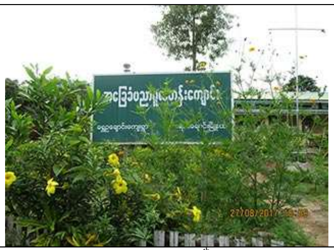
This photo was taken on August 27<sup>th</sup> 2017 in D--- village, Eh Eh village tract, K'Ser Doh Township, Mergui-Tavoy District. This photo shows the D--- village school that was established in 2015 by the Karen Development Network [KDN]<sup>3</sup>. The Burma/Myanmar government education department has provided teachers for first two years, but there are only two teachers left in 2017: one female teacher and one male principal. Therefore, students cannot study full time.

The quality of education in [Kleh Mu Htee] area is decreasing because there are not enough teachers available. Most of the [schools] in Karen villages in Thayatchaung [K'Ser Doh] Township face a shortage of teachers. Villagers report that some schools only have one principal and one teacher, some schools only have one teacher and some schools only have one principal. Regarding the education situation in D---village. school principal U^4 A---explained, "There is only one principal and one female teacher in my school so we face major teaching challenges. I [Burma/Myanmar had three other government] teachers last year, but they teach and take applied to on responsibilities in other areas this year and there were no other teachers available to replace them. Therefore, we faced a difficult situation." U A--- is also tract⁵ the B---village education administrator so he is busy travelling [for