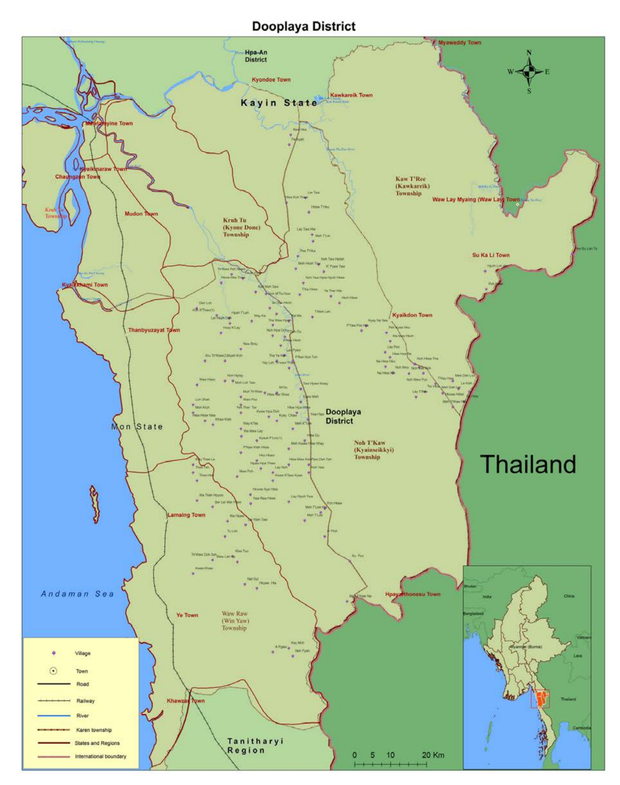
Karen Human Rights Group (KHRG)