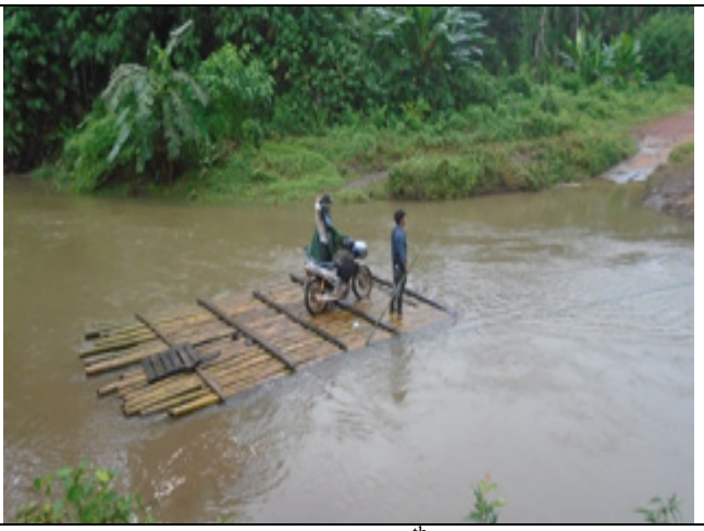
This photo was taken on July 26<sup>th</sup> 2017, in Meh T'Lah River, Meh T'Lah village, Noh Taw Pla village tract, Noh T'Kaw Township, Dooplaya District. This photo shows a motorcycle on a bamboo raft crossing the river. This villager annually makes a bamboo raft and transports villagers across the river at the cost of 1,000 kyat (US$0.73) per motorcycle.

Dooplaya District who work on plain farms face the problem of birds eating the paddy seeds that they planted on their fields. Furthermore, flooding [between July 25<sup>th</sup> to 29<sup>th</sup> 2017] damaged their paddy plants so they had to replant paddy. Also, some villagers who work on hill farms face the problem of insects attacking their paddy.