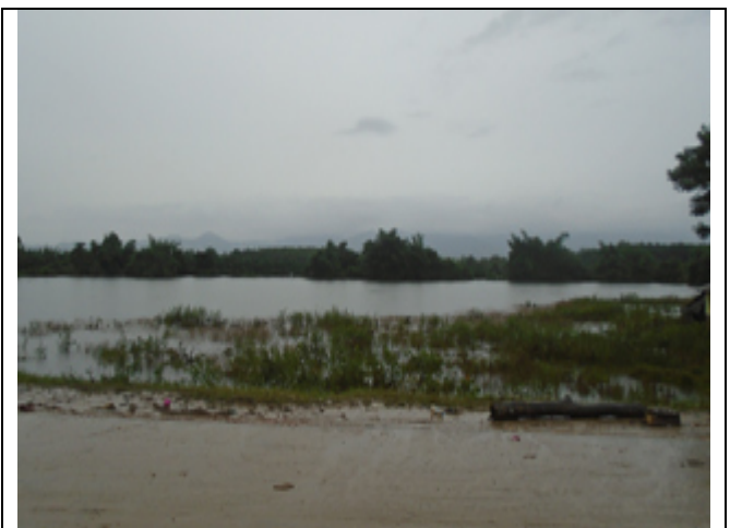
This photo was taken on August 2^{nd} 2017, in Chaw Wa village, T'Hka Klo village tract, Noh T'Kaw Township, Dooplaya District. This photo shows heavy rain from July 25^{th} to 29^{th} which has resulted in major flooding over villagers' plain farms and has damaged villagers' paddy, houses, as well as the local bridges and roads. Villagers who live close to the T'May Klo river lost their pots, spoons and other kitchen materials in the flood.

Some villagers from Noh T'Kaw Township, Dooplaya District face education challenges. The G--- village head reported to me, "There are four children from G--- village and one student from H--- village who finished Standard 4 [from their villages] and cannot further their study [advance to Standard 5] because they don't have