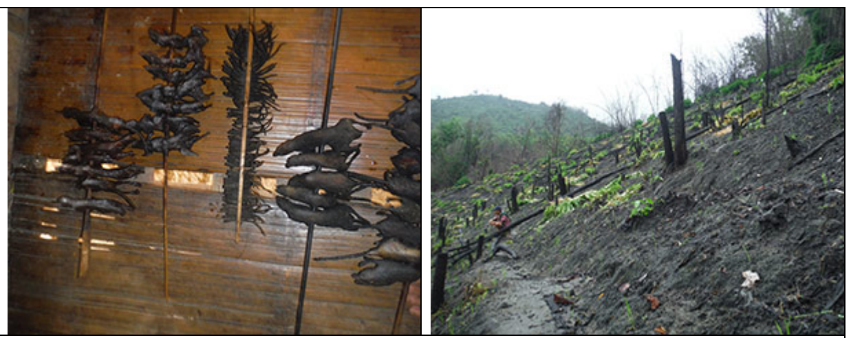
These photos show villagers' hill farms in Pay Kay village tract that were destroyed [by caterpillar and mice] so villagers could not work on their farms anymore. Some villagers could work on their farms but were only able to farm a few paddies. The villagers killed mice that were attacking their paddies with snares and by sling shooting. They killed several hundred mice per night.