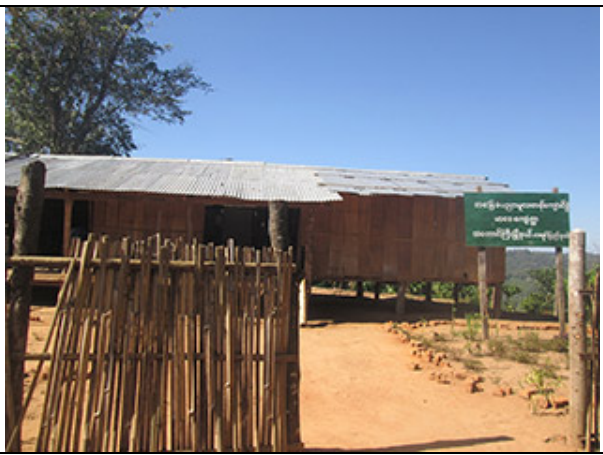
This photo was taken on December 13<sup>th</sup>, 2015 by a KHRG community member in Thandaunggyi Township, Toungoo District. It shows one subprimary school in Mar Day village, Leik Tho Town, Thandaunggyi Township, Toungoo District. In order to build the school, the villagers submitted their building school plan to the State Education Department for financial aid, but there was no support coming from State Education Department. That is why the villagers themselves then constructed the school.