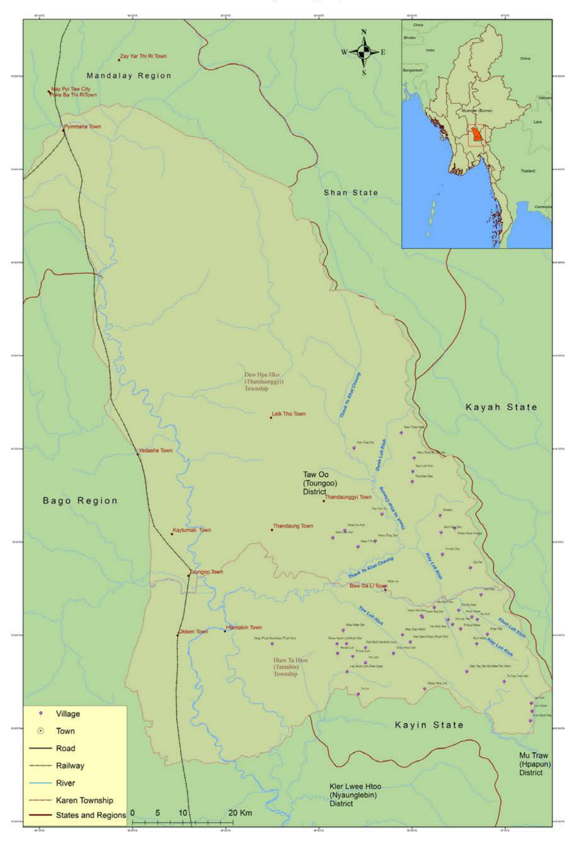
Taw Oo (Toungoo) District