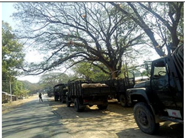
This photo was taken on January 31<sup>st</sup>, 2016. In front of IB #39 army base, 4 miles far from Toungoo Township, Toungoo District, there were more than 15 vehicles which often transported rations and ammunition to back up the temporary army camps situated in the east of Toungoo Township, Toungoo District.

During the collection of information in the past, the local villagers were not able to respond to social conflict after their lands were confiscated. Regarding land confiscation, the situation became worse because the villagers had to go to the law court and they were afraid to deal with the case in the law court. The villagers had to go whenever the authorities from the company confiscated their land. However, the situation has become better during the period between November 2015 and February 2016 because the villagers from Hton Bo village, Nan Ga Mauk village, Yay Ao Sin village and Kyet Khay Khyaung village, Htantabin Township were able to hold a demonstration in order to demand their lands [back]. It means the situation gets better because the villagers are working in unity.