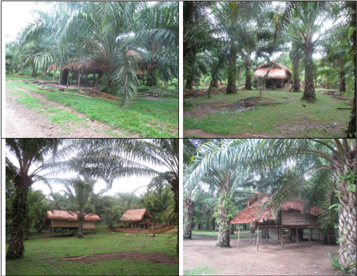
These photos were taken on May 18 th 2015 in Nge Yan Eaing village, Ma Saw village tract, Ler Mu Lah Township, Mergui-Tavoy District. These photos show the houses that the villagers constructed under palm oil trees planted by the Asian World Company in 2015. This land belonged to villagers and was confiscated in 1997. The Asian World Company has not paid any compensation to the villagers.