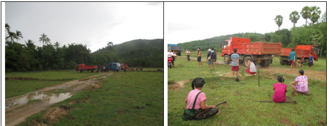
The above photos were taken on May 18 th 2015 in Thu Pyaw village, Ma Saw village tract, Ler Mu Lah Township, Mergui-Tavoy District. These photos show the villagers participating in road construction, led by the Asian World Company.

The wealthy business people [Myeik Public Corporation] are planning a [biofuels] project in the low part of Thin Baw Oo area [village tract], Ta Naw Th'Ree Township. It will cover [an area from] Toh Tee Hta to K'Wer Hta River. The project will operate on both sides of that river. They