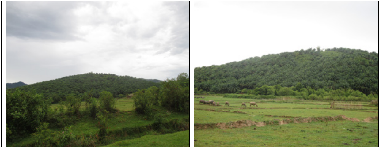
The above photos were taken on May 18 th 2015 in Thu Pyaw village, Ma Saw village tract, Ler Mu Lah Township, Mergui-Tavoy District. The photos show where Malaysian company, the Myanmar Stark Prestige Plantation (MSPP), has planted palm oil trees on the villagers' lands.

of villagers which have been confiscated. The villagers submitted the case [as a petition] to the [local] KNU leaders and requested the KNU bring the issue to the [KNU] congress [in Law Khee La]. [During the congress], they [KNU] leaders decided they would take the car keys from [MSPP Company employees] [if they did not stop working on the villagers' lands], but they are still working [on the villagers' lands]. 8