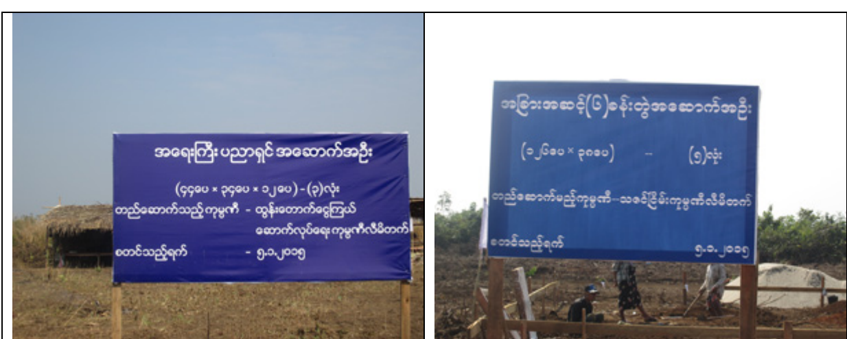
The above photos were taken on January 20<sup>th</sup> 2015, in B--- village, Noh Ta Hsguh village tract, Thaton Township, Thaton District. The photo on the left shows a sign put up by the Tun Tauk Nway Kyel Construction Co. Ltd which states that the company will construct three important academic buildings on the land. The photo on the right shows a sign put up by the Tha Zin Nyein Company Co. Ltd stating the company will construct six townhouses on the land. Both of these projects were started on January 5<sup>th</sup> 2015.