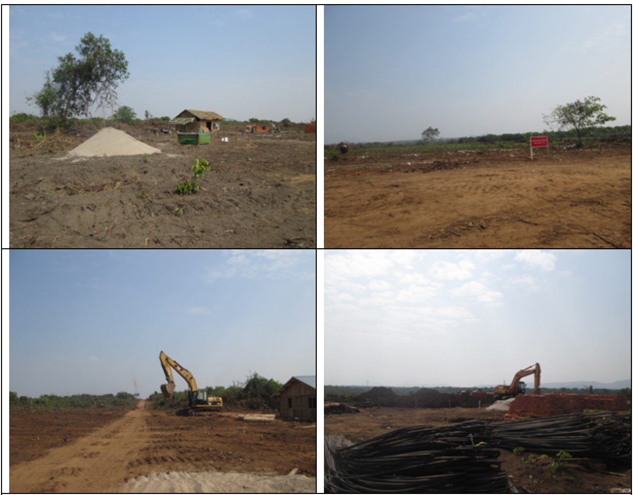
The above photos were taken on January 21<sup>st</sup> 2015, in B--- village, Noh Ta Hsguh village tract, Thaton Township, Thaton District. These photos show the caustic soda factory construction workers destroying the ground and plantations which were confiscated from the villagers.