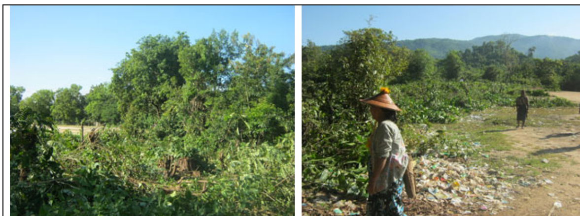
These photos were taken by a KHRG Community Member on November 12 th 2015, in Myit Ta section, Kyaukkyi Town, Kyaukkyi Township, Nyaunglebin District. The photos show the villagers from Myit Ta section and Shwegyin Karen Baptist Association members cleaning the church compound lands that are left, following the Burma/Myanmar government’s confiscation.

Currently, we are writing complaint letters and at the same time we have started clearing the area of the compound that is left. On this land was once a [Burma/Myanmar government] army base, so we worry that unexploded ammunitions and landmines might have been left. We have to try and help each other with what we can do.”