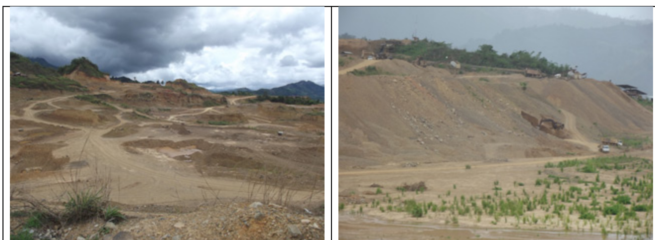
These photos were taken on May 13 th 2014 near Hkay Ter village, Hkay Ter village tract, K'Ser Doh Township, Mergui-Tavoy District. These photos depict a lead mining operation conducted by an unknown company and the subsequent destruction of the surrounding environment. The top-right photo shows the former location of a village which had been displaced due to the project.