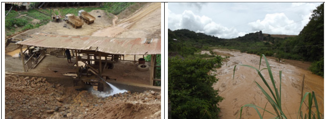
The above photos were taken in May 2014 near Hkay Ter village, Hkay Ter village tract, K'Ser Doh Township, Mergui-Tavoy District. The top-left photo shows workers releasing water used during a lead mining project. The top-right photo depicts the local Hkay Ter river nearby the lead mining project and the subsequent damage to the stream, which has become muddy and polluted. Local villagers can no longer use the water from this stream for their daily needs.