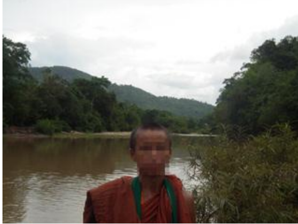
This photo was taken by a KHRG community member on May 31<sup>st</sup> 2014 near Waw Lay village, Nabu Township, Hpa-an District. It shows Saw M---, head monk of W--- Monastery, which is under threat from the proposed Pa Ta Dam construction site.

The proposed dam would pass through the current site of a pagoda on Kyet Oo Taung Mountain, W--- Monastery, Waw Lay village and Htee Hseh Hker village. The resultant flooding could impact a far wider area. Local villagers fear that if the project is implemented as intended, it will have numerous negative effects on approximately 40 villages in Nabu Paingkyon townships. environmental and social impacts, such as displacement, migration and destruction of livelihoods will almost certainly result if villagers' paddy fields and plantations, houses, schools, pagodas and monasteries flooded. The upcoming implementation of the project has caused thousands of villagers to feel that they are under imminent threat,