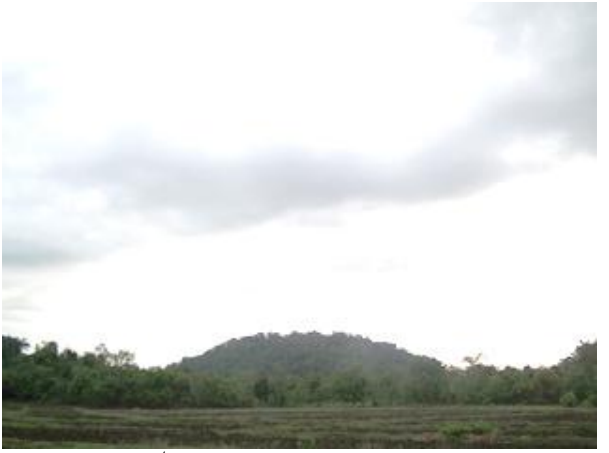
These photos were taken by a KHRG community member on May 31<sup>st</sup> 2014 in Htoh Kaw Koh village, Nabu Township, Hpa-an District. The photo on the left shows the Pa Ta River, near the proposed site of the Pa Ta Dam project. The photo on the right shows Kyet Oo Taung Mountain, which the proposed dam would be built on.