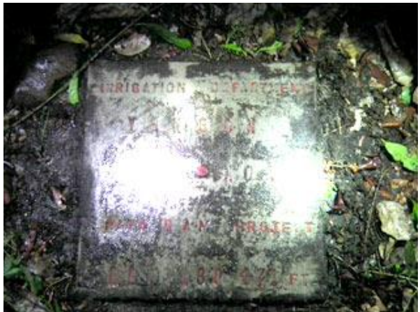
These photos were taken by a KHRG community member on May 31<sup>st</sup> 2014 in Htoh Kaw Koh village, Nabu Township, Hpa-an District. They show one of the concrete measurement markers that were placed by unknown people at the bottom of Kyet Oo Taung Mountain in 2007. The words on the marker are; IRRIGATION DEMARTMENT , YANGON, BM NO 1, PA TA DAM PROJECT, and AL 130 471 FT.

The proposed dam would pass through the current site of a pagoda on Kyet Oo Taung Mountain, W--- Monastery, Waw Lay village and Htee Hseh Hker village. The resultant flooding could impact a far wider area. Local villagers fear that if the project is implemented as intended, it will have numerous negative effects on approximately 40 villages in Nabu Paingkyon townships. environmental and social impacts, such as displacement, migration and destruction of livelihoods will almost certainly result if villagers' paddy fields and plantations, houses, schools, pagodas and monasteries flooded. The upcoming implementation of the project has caused thousands of villagers to feel that they are under imminent threat,