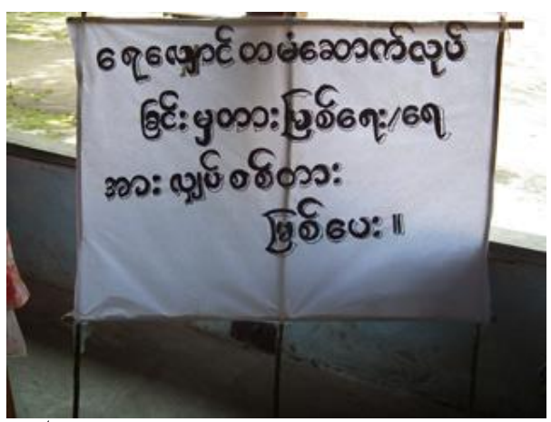
A KHRG community member took these photos on May 31<sup>st</sup> 2014 in Htoh Kaw Koh village, Nabu Township, Hpa-an District. They show two banners prepared for a meeting organised by local villagers and Buddhist monks to enable local people to express their opinions on a range of problems facing their communities. The banner on the left reads: "Ban the drugs." The banner on the right reads: "Ban the construction of the [Pa Ta] dam."

The five main actions demanded by villagers are: